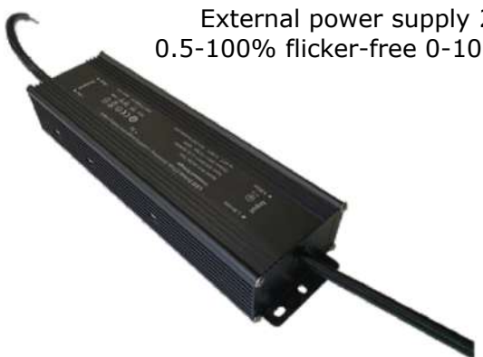
External power supply 200/300W 0.5-100% flicker-free 0-100% dimmable